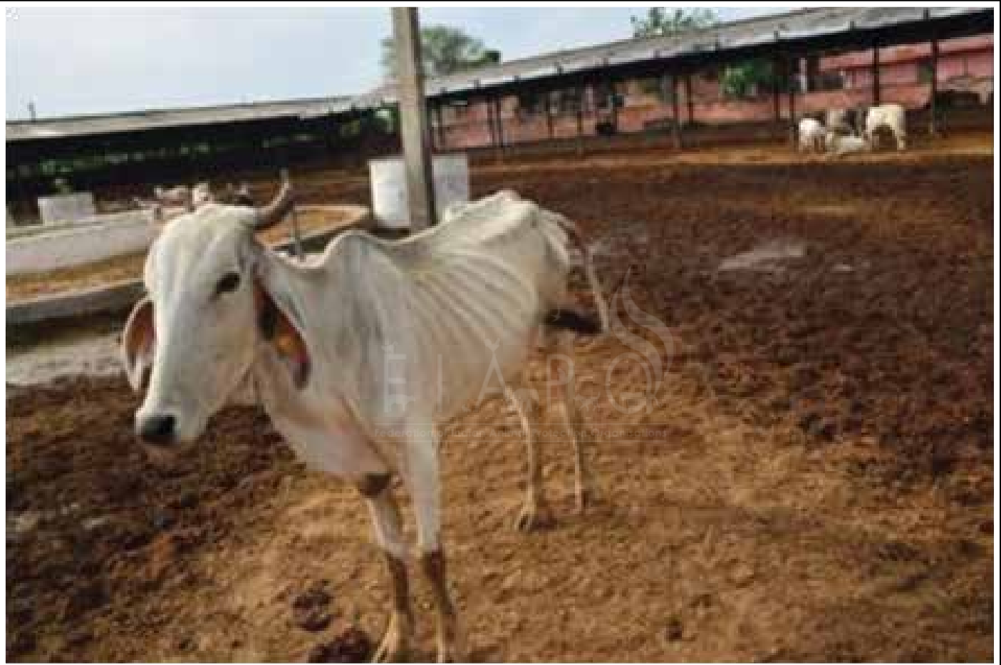
Emaciated cows are a common site in the Centre