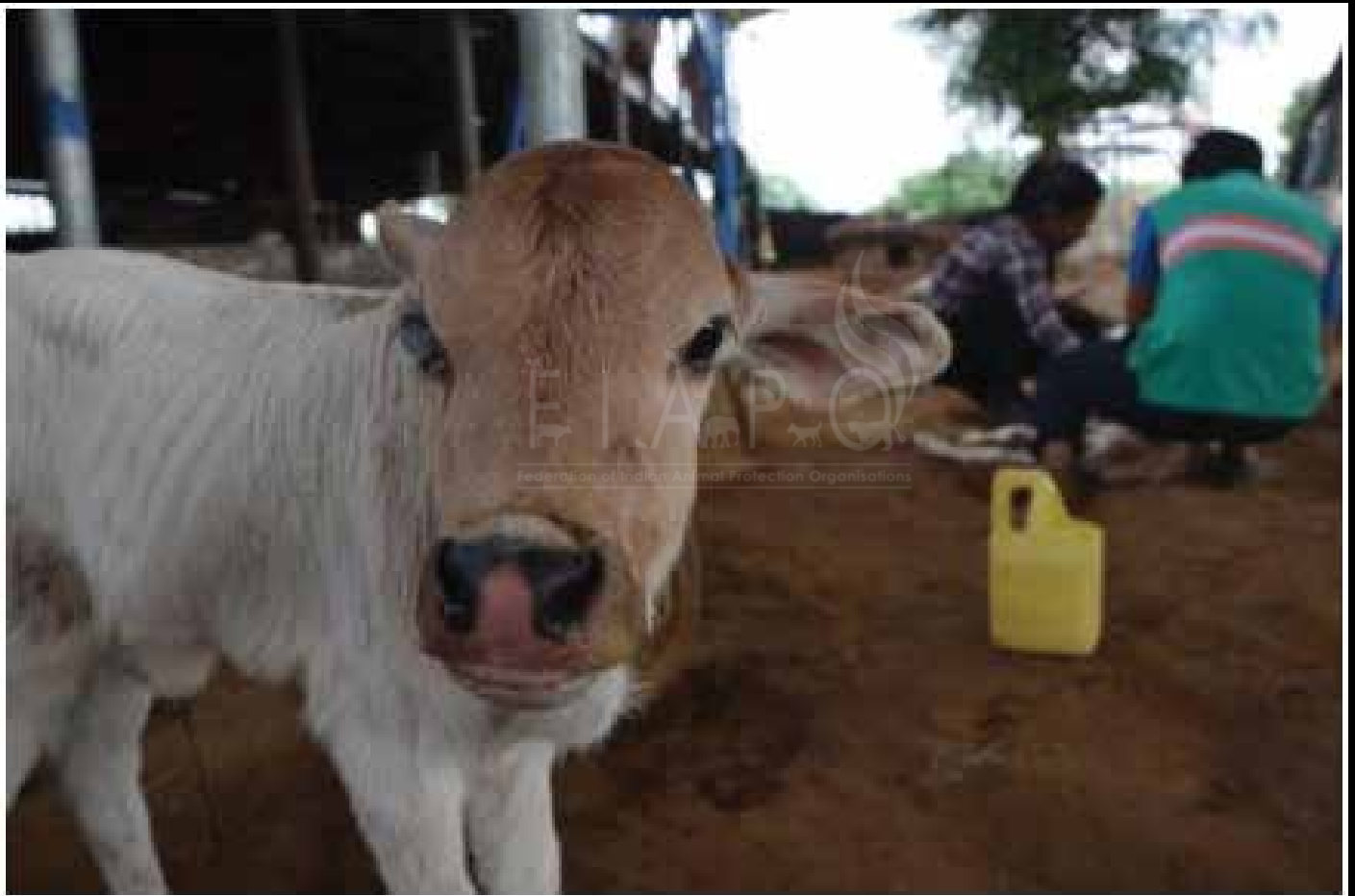
A calf with a blind eye as a result of an infection.