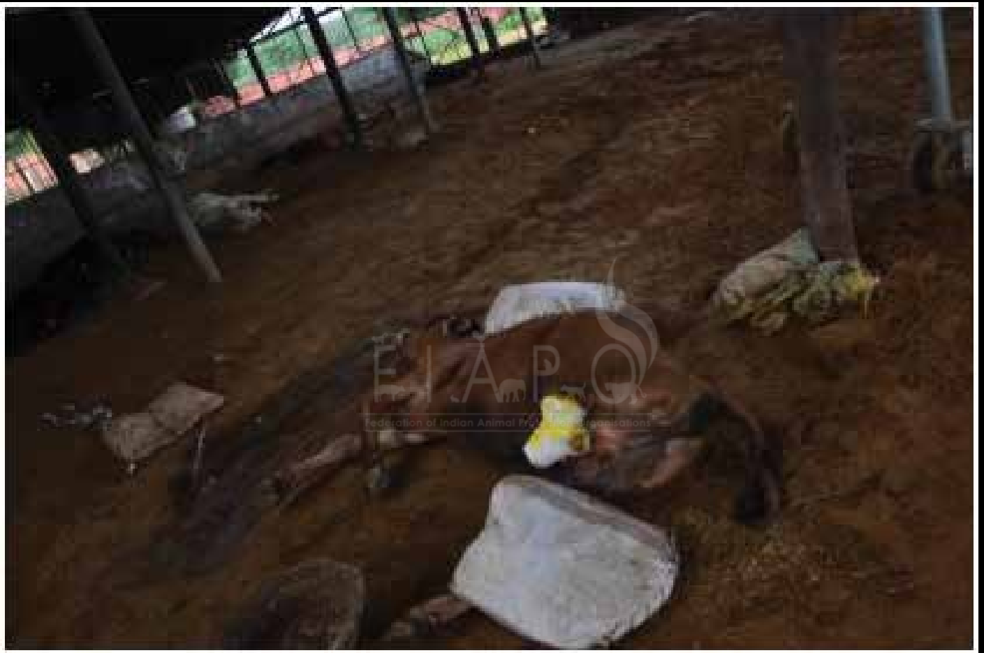
Due to shortage in food, severe competition among the cattle resulted in fractures, & wounds, requiring immediate amputation surgeries.