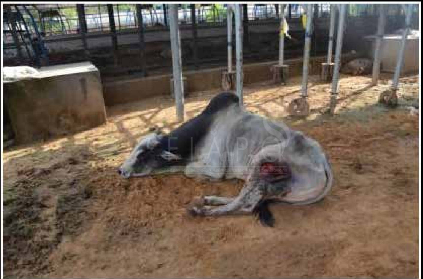
Animals have become sick and injured due to the negligence of the workers and authorities of the Centre. Many were found stuck and unable to move in sludge created in the rains due to mud and excreta.