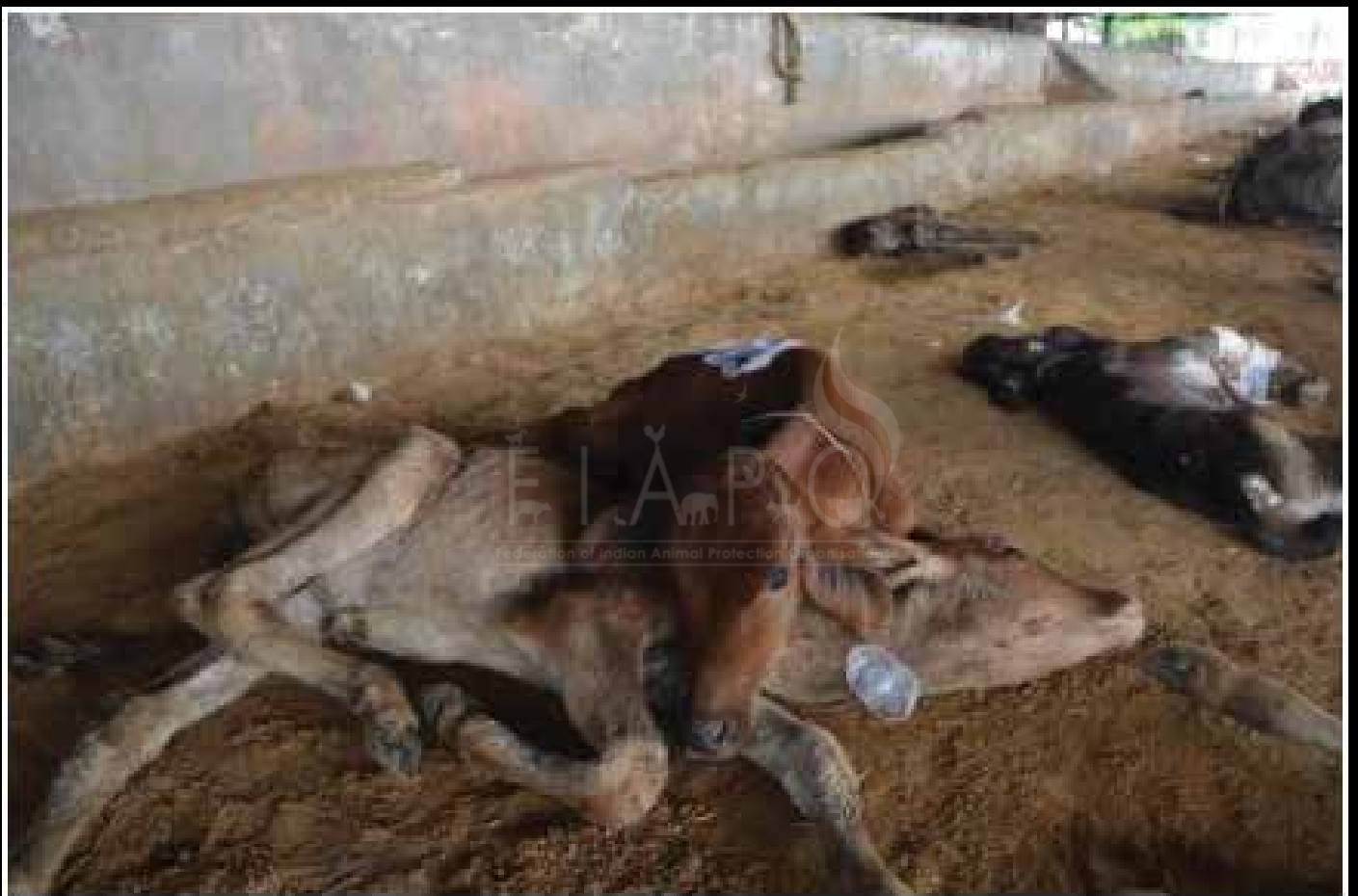
Weak and injured calves were seen heaped in the treatment enclosure due to lack of space.